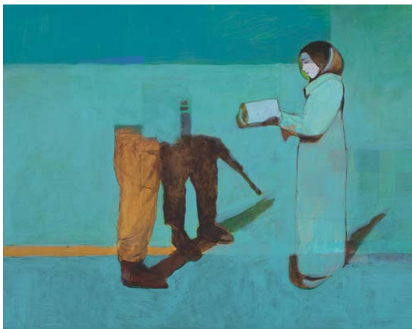
Khaled Hourani (Palestine), Suspicion , 2019.

Palestinians who have Israeli citizenship ( ezrahut ) do not have the right to nationality ( le'um ), which means that they can only access inferior social services, and that they face restrictive zoning laws and find themselves unable freely to buy land. Palestinians in East Jerusalem are reduced to the status of permanent residents who must constantly prove that they live in the city. Palestinians in the West Bank live 'in ways consistent with apartheid', write the authors of the UN report. And those who are exiled to refugee camps in Lebanon, Syria, and Jordan have been permanently denied their rights to their homeland. All Palestinians – whether those who live in Haifa (Israel) or in Ain al-Hilweh (Lebanon) – suffer the consequences of Israeli apartheid. This indignity is punctuated with laws that humiliate Palestinians, each one meant to make life so miserable that they are forced to emigrate.