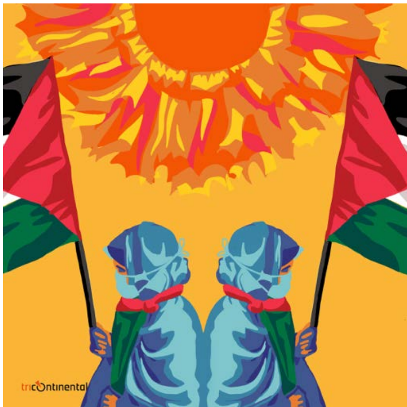
Palestine , inspired by the original poster of Ronaldo Cordova (OSPAAAL, Cuba), Solidarity with Palestine , 1968.

tilt, always afraid of the settler's bullet or the soldier's handcuffs. Prison walls are made of stone. Settlement walls are made of stone. But the walls of the homes of a Palestinian are made of that odd combination of fear and resistance. There is fear that the cannons of the coloniser will blast through them, but there is resistance that acknowledges that the walls of the home are not the real walls. The real walls are the walls of fortitude and perseverance.