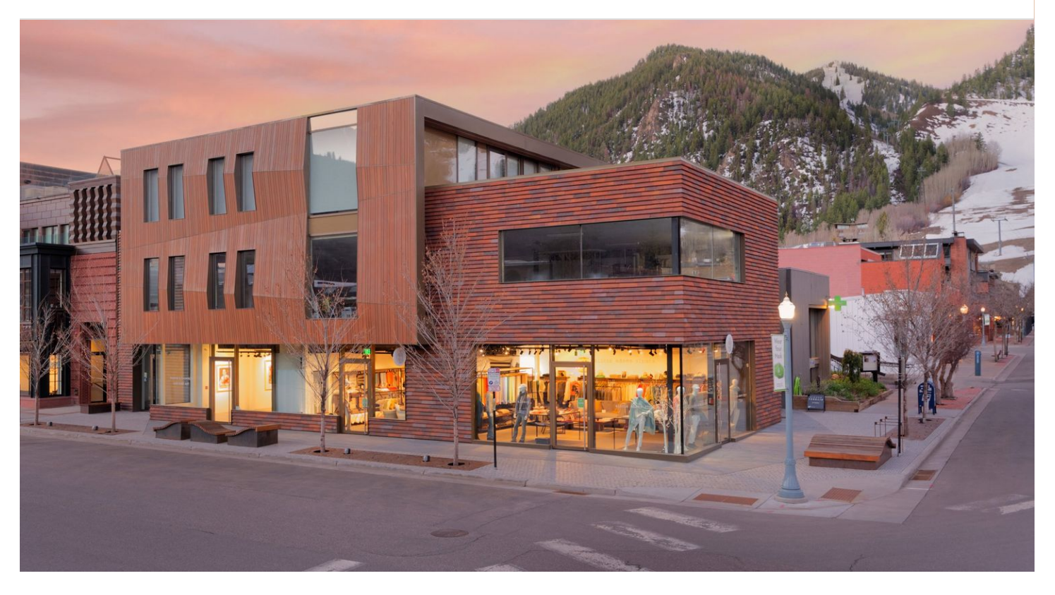
Lehmann Maupin and Carpenters Workshop's shared gallery space in Aspen.

A growing number of art galleries are opening seasonal spaces in Aspen, Colorado, in pursuit of deep-pocketed U.S. collectors. The move builds on positive experiences with pop-ups in destinations like <u>the Hamptons</u>, New York, and Palm Beach, Florida.