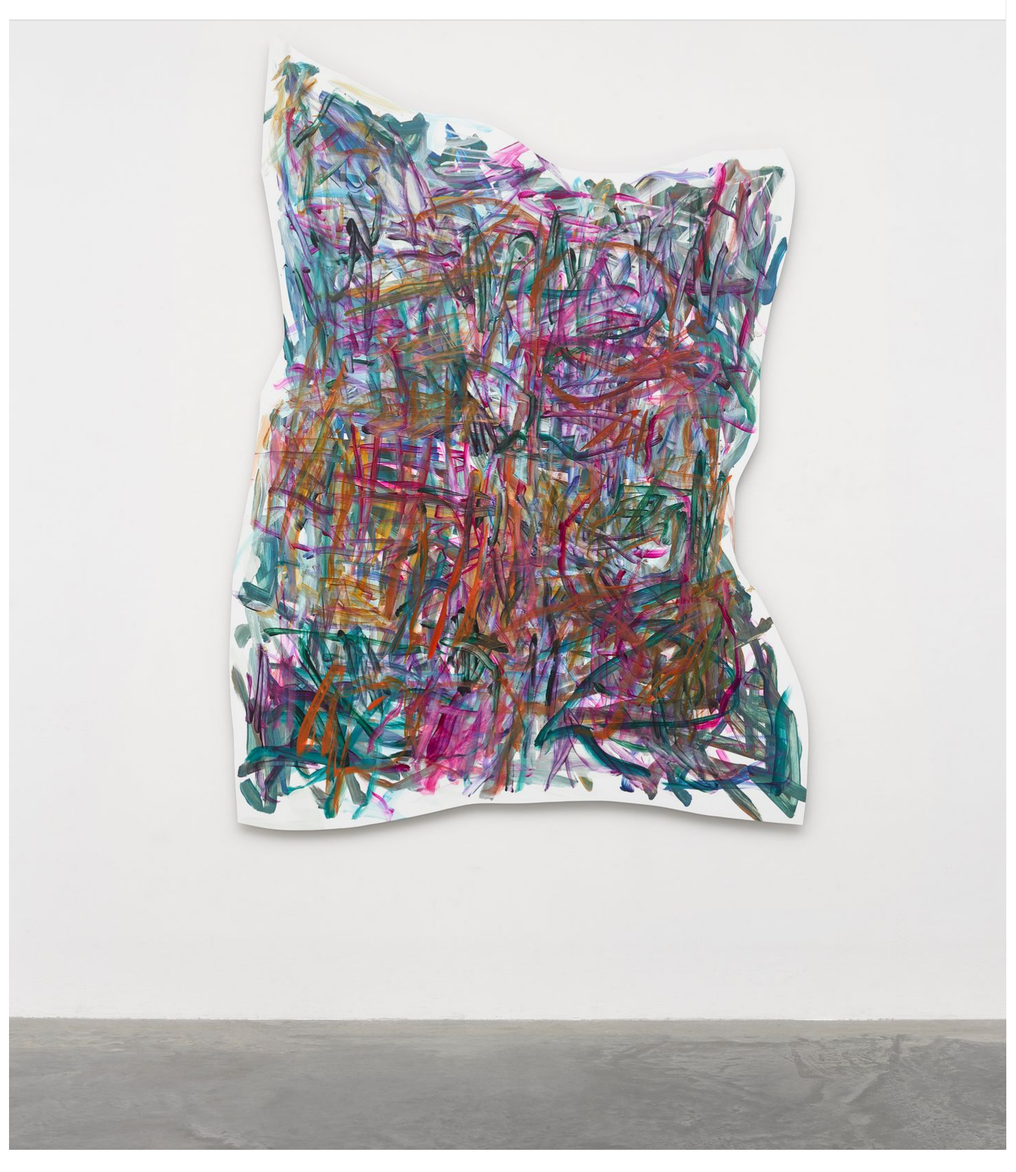
Imi Knoebel, Figura Psi (2019). Acrylic on aluminium. 239 x 173 x 4.4 cm. Copyright the artist.