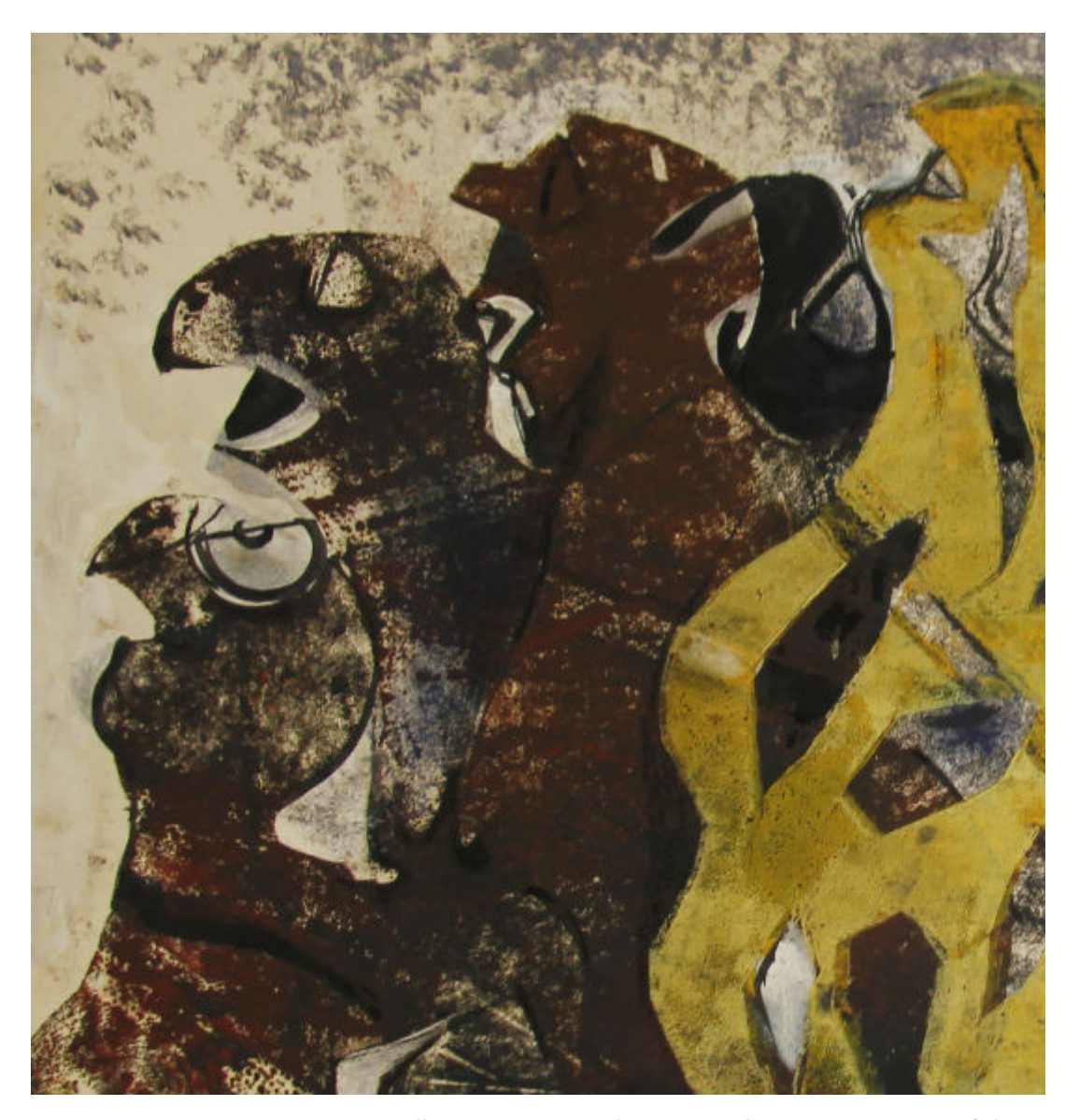
Margo Veillon - Metamorphose Detail, 1967, Courtesy of the a

The entire art history in Egypt is strongly connected to the shift of political systems, where important changes occurred during the 20th century – from 1908 under the British colonial rule to the independence in 1952, followed by the era of the president Gamal Abdel Nasser. Artists were productive through this entire time and gave important responses and actions within these enormous changes, making the position of Egyptian Modern art unique in the Arabic art world. It is marked by its dedication to experimentation and progression, in tandem with the social and cultural consequences of many political conflicts it went through. Art became a visual component of the state policy, making the harsh realities of the living conditions and social struggles often poised with Egyptian mythology and folklore.