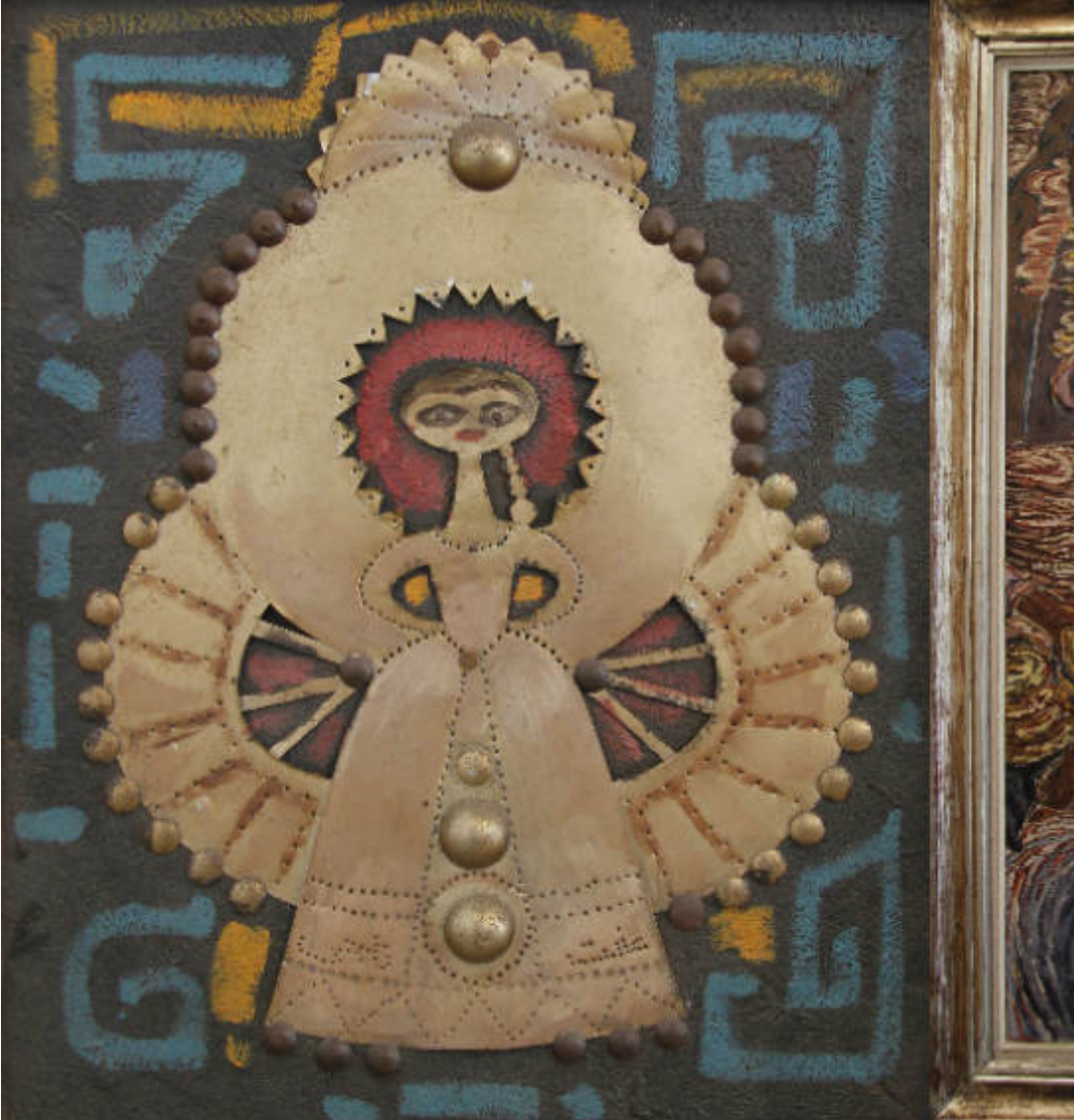
Left: Effat Naghi – El Arousa, Courtesy of a Private Collection / Right: Inji Efflatoun and Green Art Gallery, Dubai