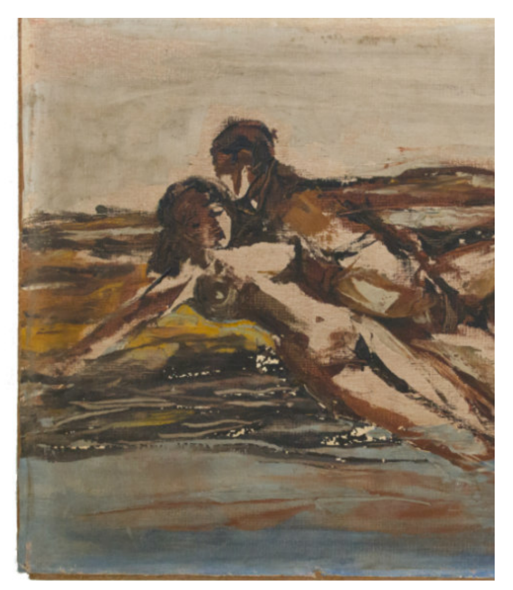
Gazbia Sirry - Untitled nude, Courtesy of the artist and Gr

In 1950s Egypt, some quite significant legislations were issued to elevate the women's status in the society, and during this period female artists had <u>a huge impact on the society</u> through their innovative and brave works. The revolution that brought independence in 1952 offered a sense of hope for many artists along with a motive to portray new topics shaped by their yearning for liberty. Female artists were very active and affiliated with various movements happening at the time, where for an example Inji Efflatoun exhibited with the Art and Freedom Group, which used <u>Surrealism</u> as a means to fight back Fascism and art's alignment with political propaganda. On the other hand, Gazbia Sirry was an important part of the Group of Modern Art, which used heavy symbolism in order to visually represent the national independence and social justice .