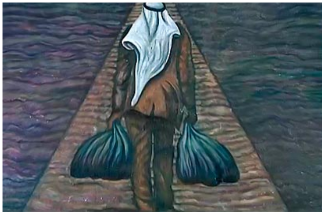
'The Refugee,' a painting by Canaan