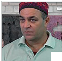
Canaan: Art breaks down barriers