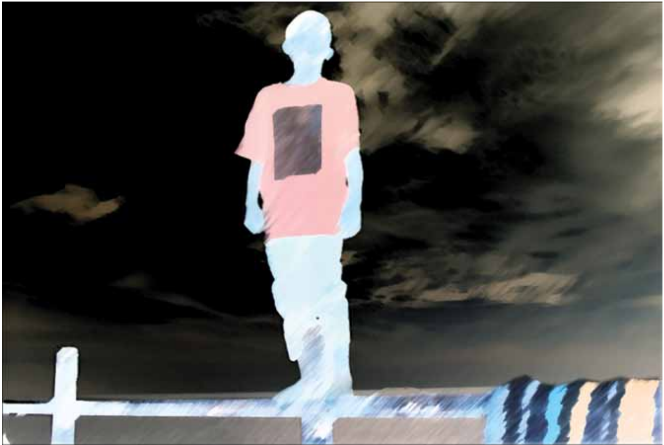
End of Days, 2003 Digital editing. Light boxes installation placed at random in a complete darkened room

in a world where there is a copy with no original, and I realised that Jerusalem had indeed been transformed into an image in people's minds, and I was simply living in that image. This was not where I belonged. There was no home."