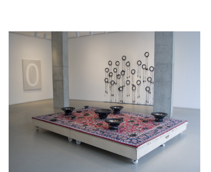
MOUNIR FATMI, Oriental Accident, 2011, sound system, speakers, carpet on wooden structure, 50 × 336 × 226 cm.