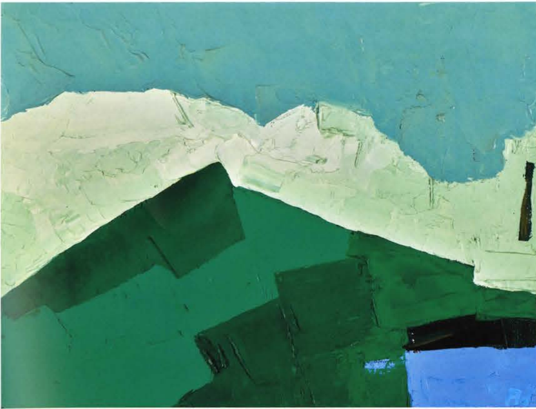
Etel Adnan, Oil on canvas, 22.9x30.5, 1984. Sold for $65,000 at Sotheby's, October 2018