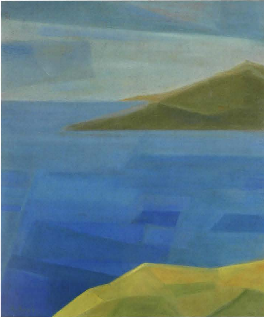
Helen Khal, Seascape , Oil on board 56x47. Sold for $28,000 at Bonhams, May 2019