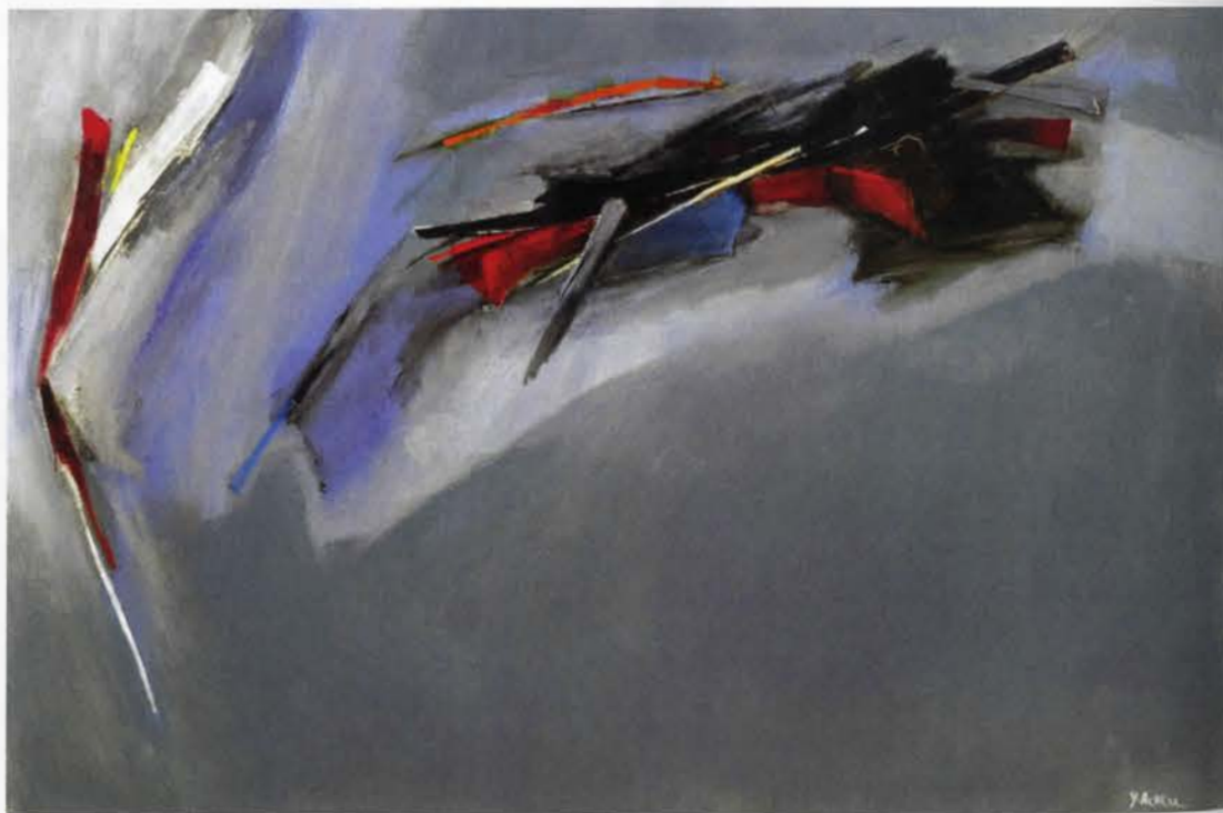
Yvette Achkar, Oil on canvas, 70x100. Sold for $62,500 at Arcache, November 2018