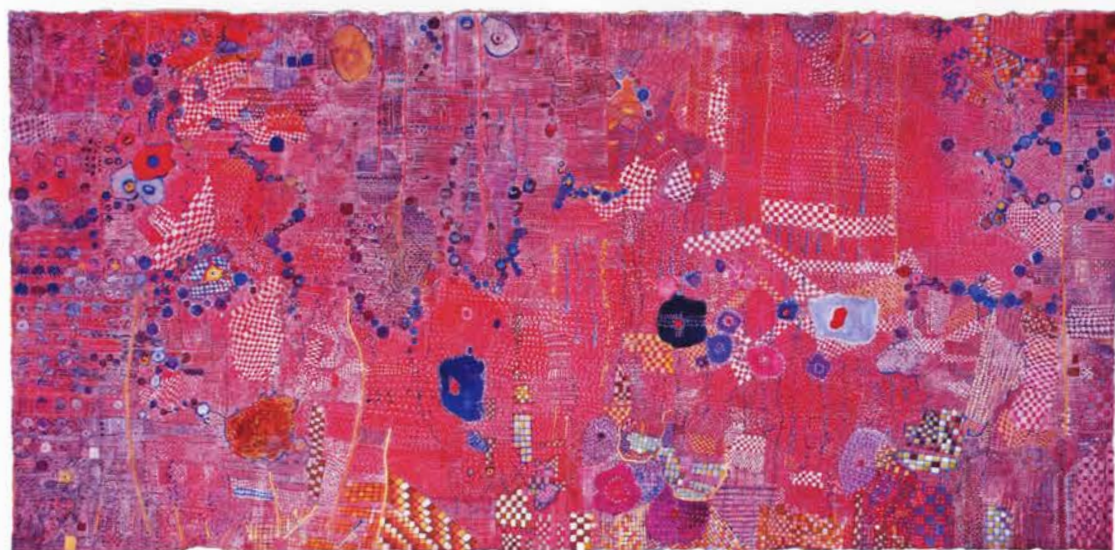
Huguette Caland, Good Luck, Acrylic, Colored and silver pens on loose canvas, 120x210, 2009. Sold at Christies for $162,500, March 2018

This year a 1973 Caland painting commanded over $242,000. The same work was sold for $149,000 by Christie’s in Dubai four years ago