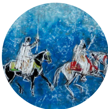
BEN BARKA Hassan El Glaoui MOROCCO

Country: Morocco • Exhibition: • Caravan