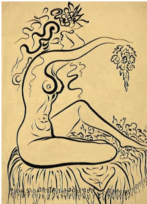
Adham Ismail, Untitled, Ink on carton, 44 x 32 cm