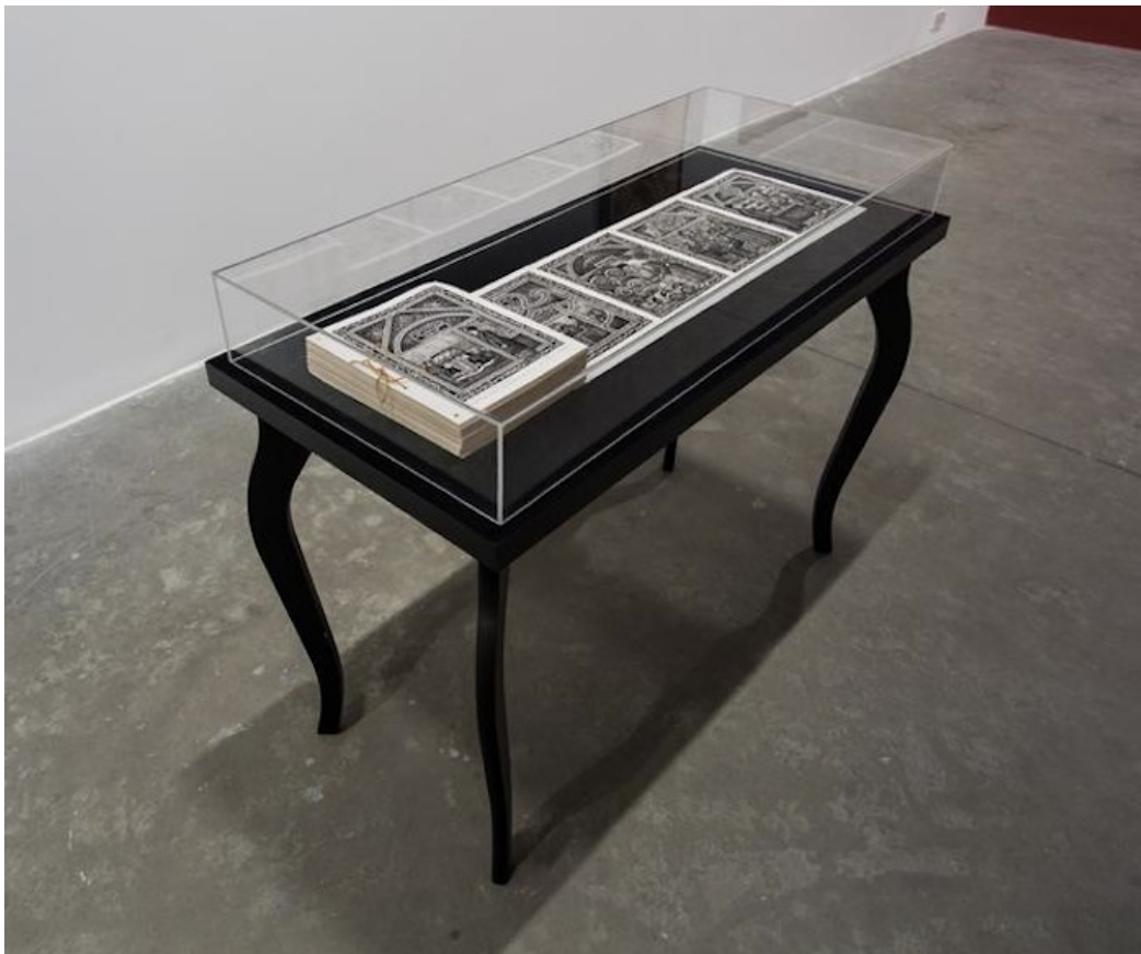
Installation view of Khaldoun Shishakly's Shops