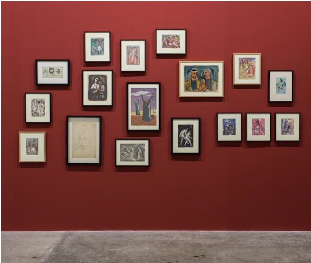
Installation view of Works on Paper: Hikayat