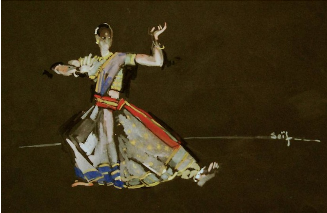
Seif Wanly, Untitled, c. 1953, Pastel on canson paper, 30.5 x 47 cm