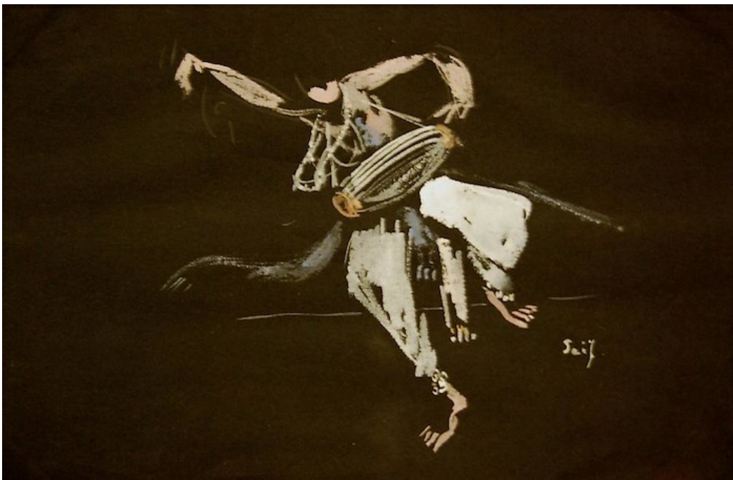
Seif Wanly, Untitled, c. 1953, Pastel on canson paper, 30.5 x 47 cm

The theatrical and the sublime is present in the work of Egyptian artist Seif Wanly (1906-1979). The exhibition includes several works on paper in which he portrayed society's more esoteric dimensions, featuring medieval traditions, circus acrobats and ballet dancers.