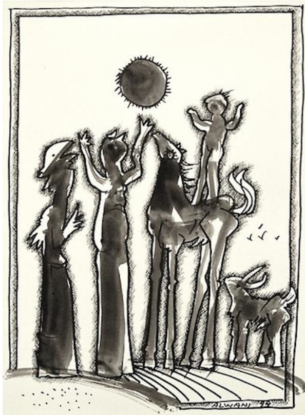
Khouzayma Alwani, Untitled, 1999, Ink on canson paper, 35.5 x 26.5 cm

The region's political turmoils in the 1970s and 80s are portrayed by Khouzayma Alwani (b.1934, Syria). Alwani's delicate horrors are so exquisite they beguile the viewer into fascination with intricate imagery. Following the Hama Massacre of 1981,