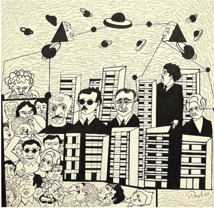
Aref El Rayess, Untitled, c. 1973, Ink on canson paper, 37.5 x 38 cm

The work in the exhibition by Aref el Rayess (1928-2005, Lebanon) belong to a series of drawings he produced in the early 1970s to denounce the corruption he was witnessing within the political circles governing the Middle East after the Cairo accord in 1969 and the 1973 Arab Israeli war.