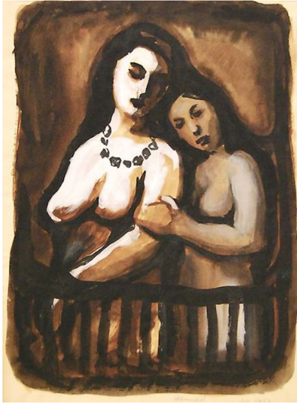
Mahmoud Hammad, Untitled, 1957, Gouache on paper, 35 x 26 cm