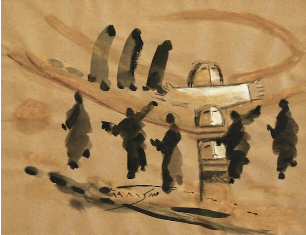
Fateh Moudarres, Untitled , 1981, Watercolor on paper, 29.5 x 38.5 cm

For Fateh Moudarres (1922-1999, Syria), his representational language was engaged with mythology, religion and popular lore as well as a deep political engagement. An accomplished writer and poet, his "dessins" were also featured in several of his published short stories.