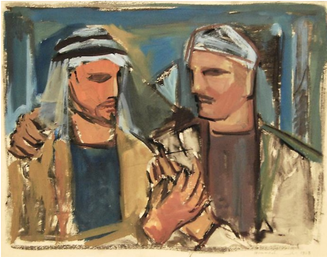
Mahmoud Hammad, Untitled, 1958, Gouache on paper, 36 x 46 cm