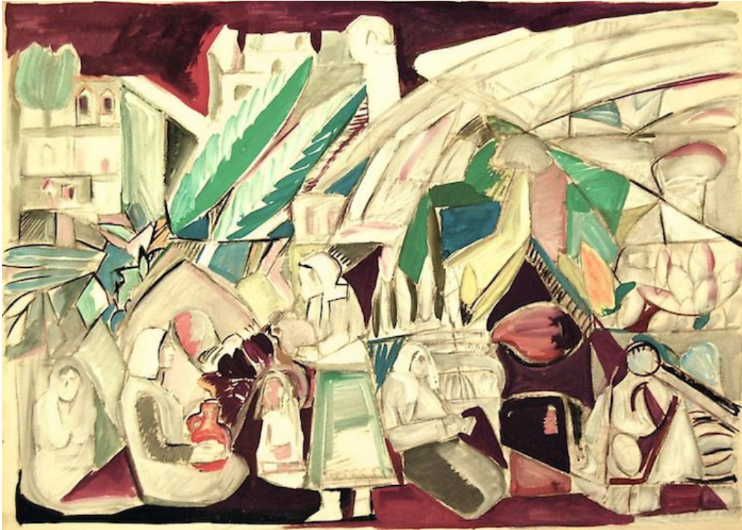
Jamil Molaeb, Untitled , c. 1992, Gouache on carton, 50 x 70 cm

For many artists of his generation, storytelling included the representation of the traditional rural life they were witnessing. This is true of Lebanese artist Jamil Molaeb's (b. 1948) works, which were inspired by the landscapes he saw in the mountains of Lebanon and other sceneries from the traditional life of different Arab communities, depicting in his own way the villages, cities, fields and the people in their daily life.