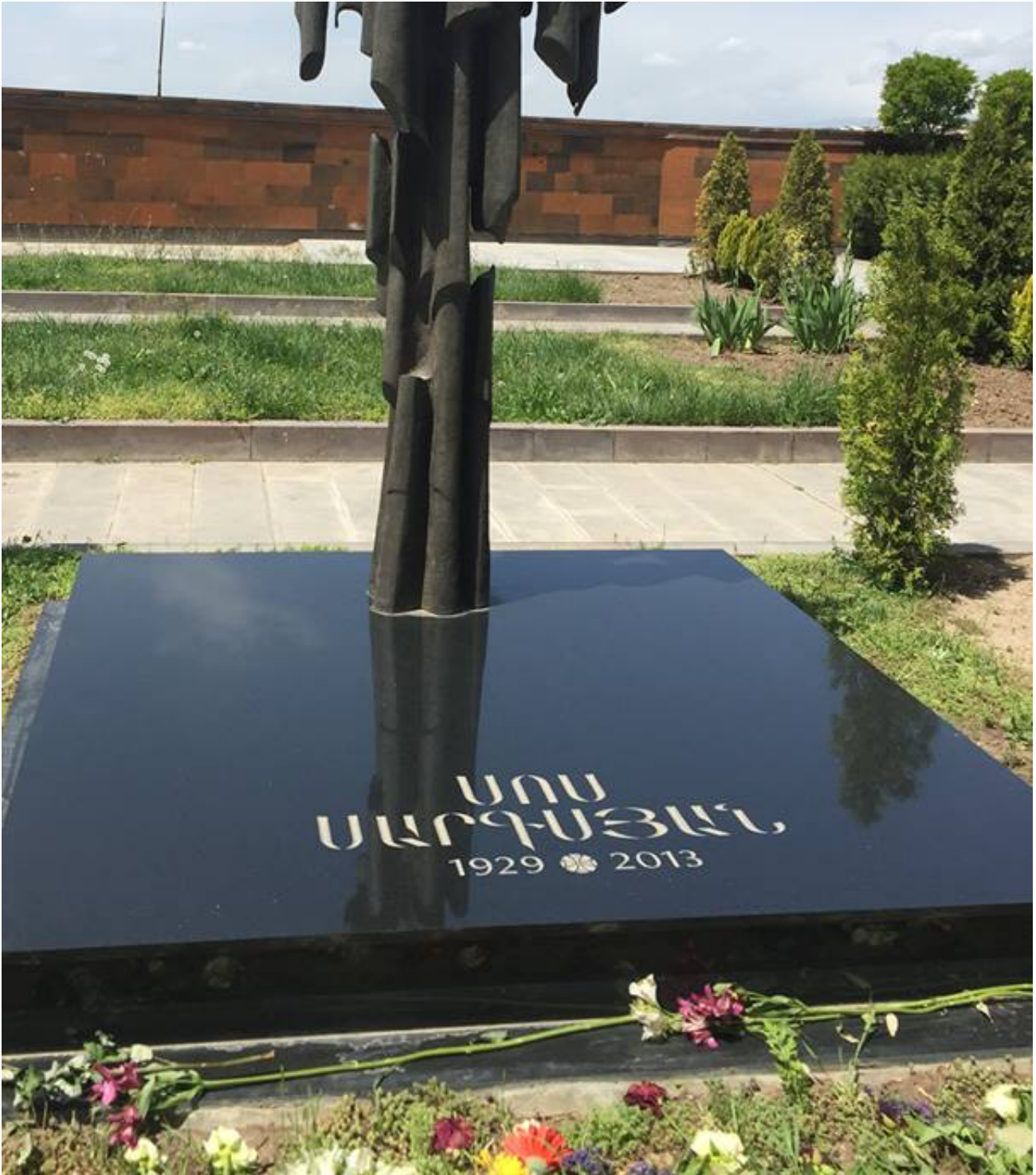
The late Armenian actor Sos Sargsyan's bronze portrait sculpture, commissioned in 2013