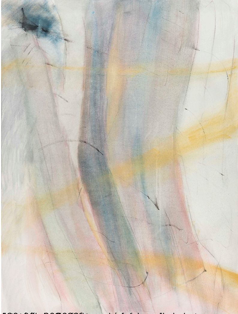
https://www.selectionsarts.com/afaf-zurayk-beirut AZK-203, Afaf Zurayk, Beirut Octet, Mixed Media on canvas, 120x90 cm, 2022 © Saleh Barakat Gallery