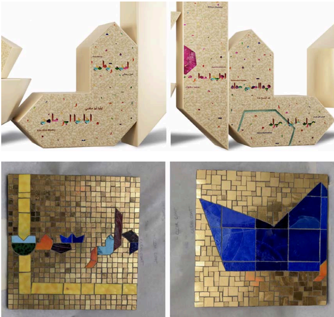
Details of the sculpture (top), and the mosaics that will be displayed on the bench seat backs (above). The names of the writers, in Arabic and English, as well the artist's invented calligraphy, will be written on the piece.

Community Board 1's Waterfront, Parks and Cultural Committee acknowledged the need to recognize the neighborhood's history, but was less than enthusiastic about the project when the proposal first came before it for advisory approval in March. Saying that it overwhelmed the relatively small park, the committee asked the Parks Department and Jacobs to come back with a scaled-down version of the installation. They returned in July after scrapping four proposed 11-foot-long mosaic panels inscribed with the artist's made-up letters. The proposal squeaked by the committee, 6-4, and won the overwhelming consent of the full board. But the board's resolution implored the Public Design Commission and Parks Department to try to "mitigate the impact" of the pieces and "be careful in approving permanent large-scale artwork to take over major portions of parks such as in this case."