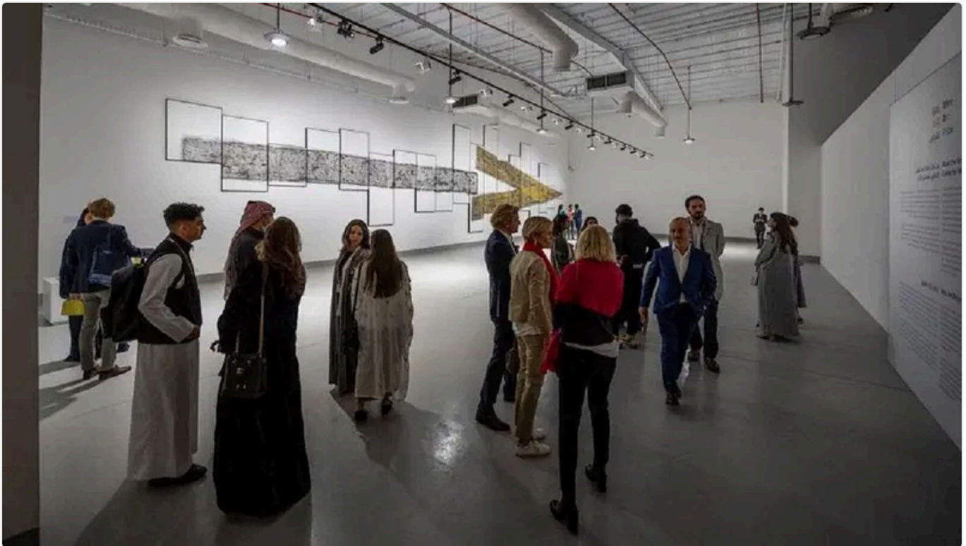
The Ithra Art Prize winning work is displayed at the Diriyah Contemporary Art Biennale, which runs until March 11, 2022.