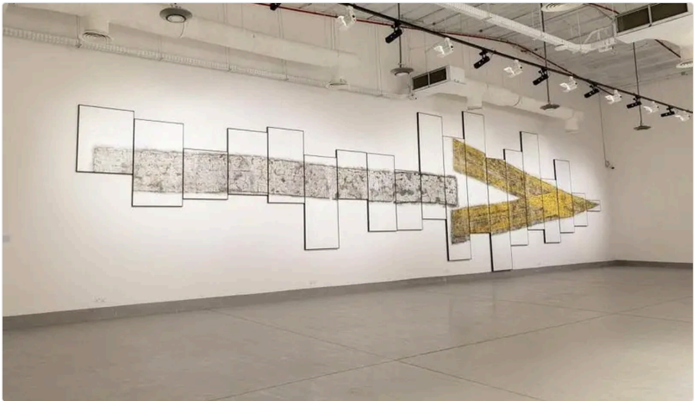
Kaabi-Linke's monumental work consists of 19 canvases depicting the cracks in a sign bearing an arrow, a symbol associated with the aviation industry and with economic growth.

Kaabi-Linke's artwork takes a reflective look at one of the effects of the pandemic and the decline in commercial air traffic, which raises questions about how humanity measures progress and economic growth.